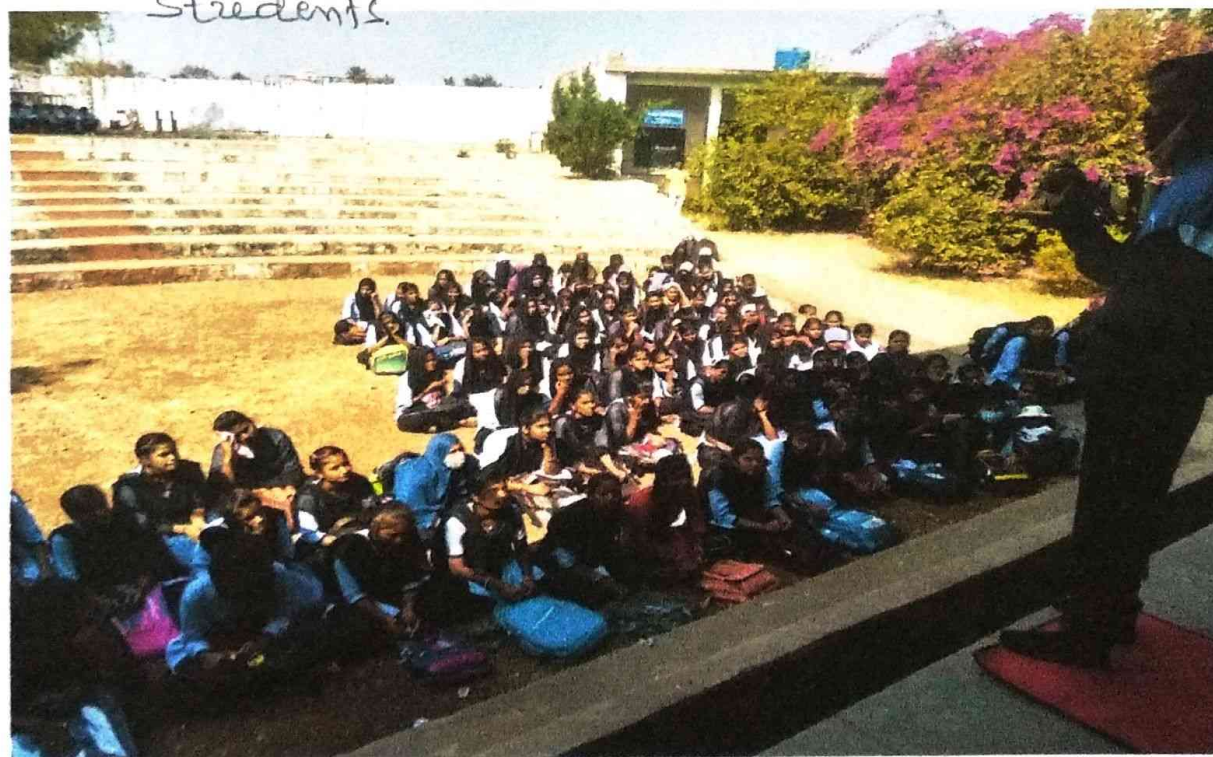
Figure 6 YOGA GURU EXPLAINING WHAT ARE THE TYPES OF YOGA, WHAT ARE THE BENIFITS OF YOGA AND HOW MEDITATION IS TO BE DONE. On 06-02-2021