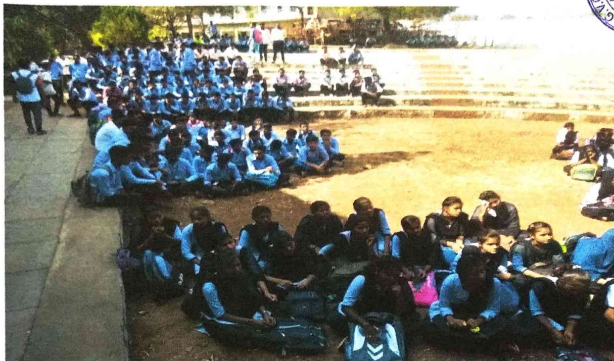
Figure 5 Students observing different yoga steps On 06-02-2021